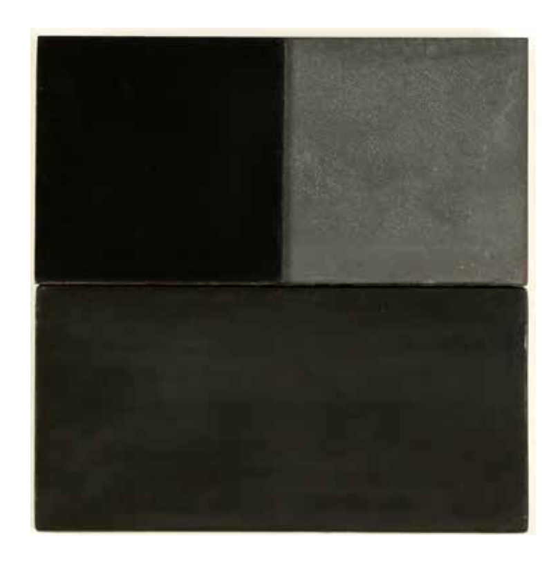
untitled pocket painting, 1974, slate, casein and oil on masonite, 8 x 8 inches