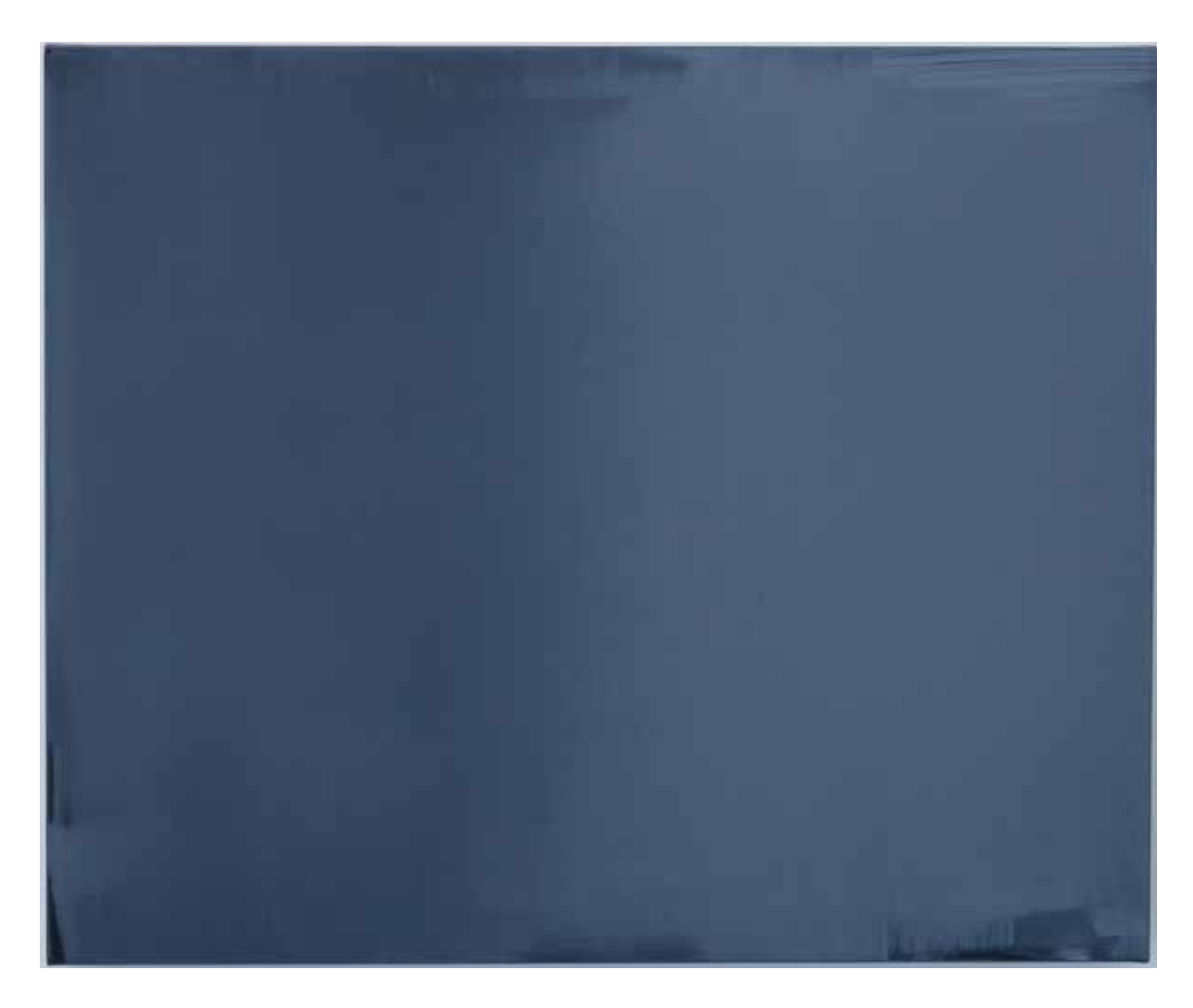
mise en abyme, 2015, oil on linen, 21.5 x 26 inches