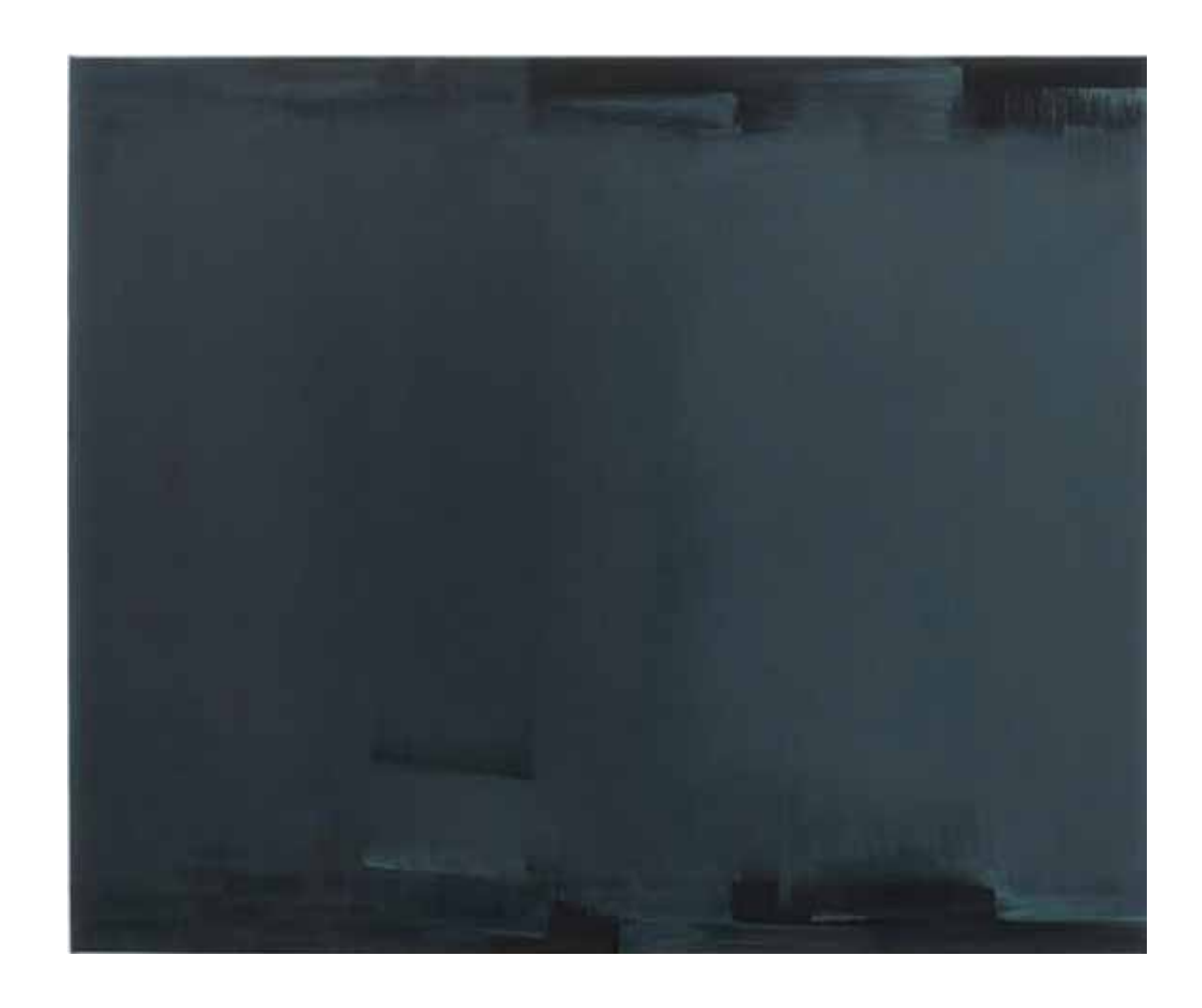
the black clock, 2017, oil on linen, 21.5 x 26 inches