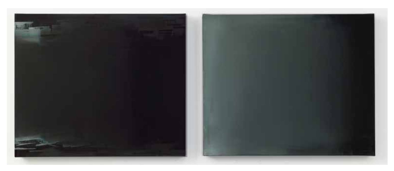
Black milk of daybreak we drink it at evening we drink it at midday and morning we drink it at night..., 2016, oil on canvas, diptych, 21.5 x 53 inches