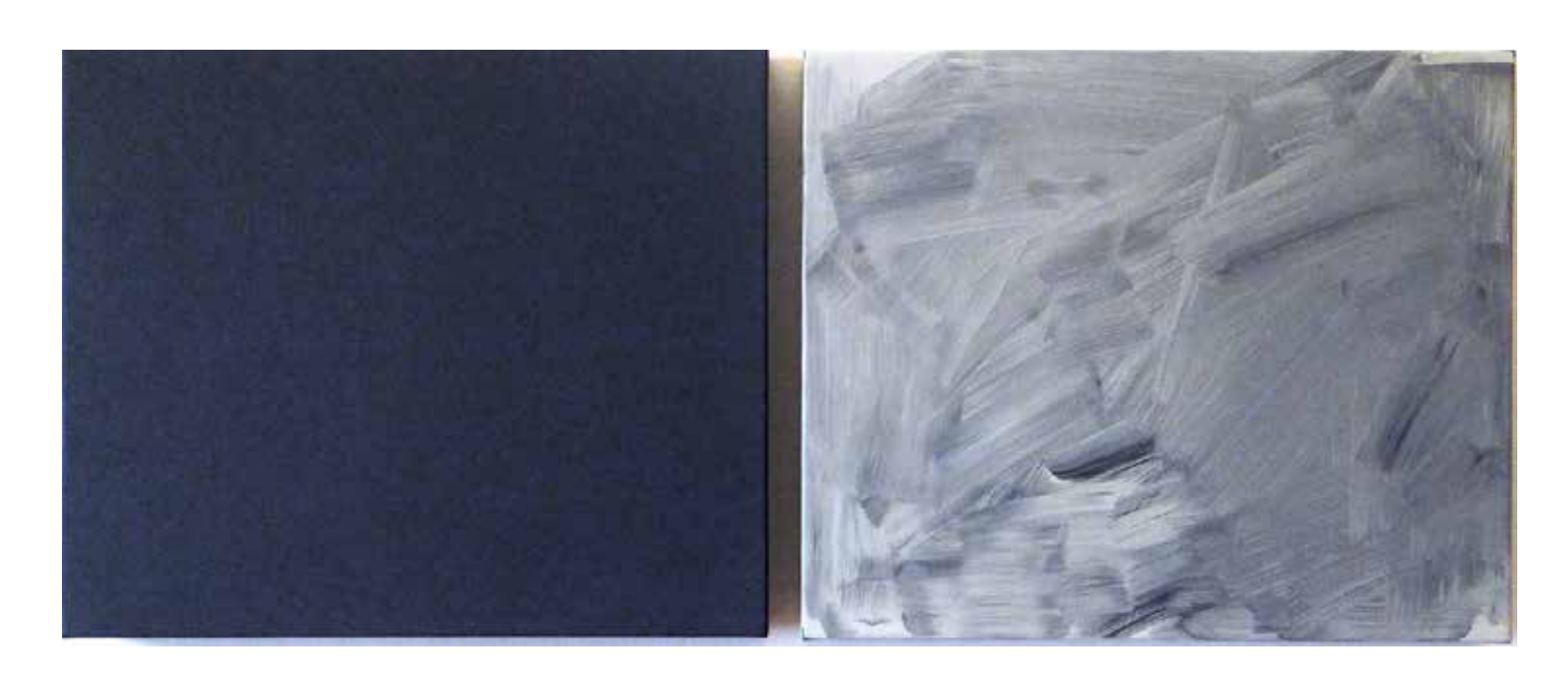
the painting undressed 2011, oil on linen, diptych;, 18 x 40 inches