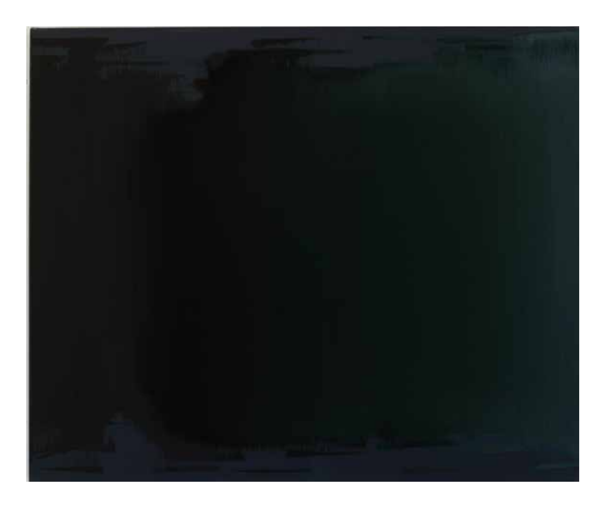
night reading 2015, oil on linen, 21.5 x 26 inches