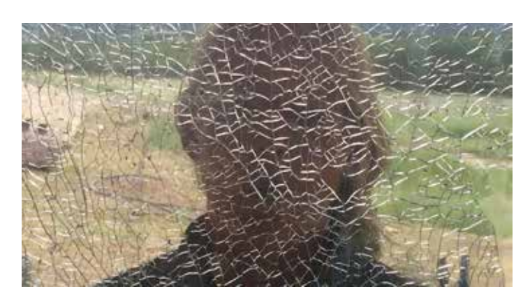
artist in Coloardo 2014