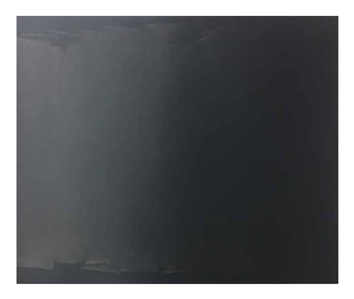
On Kawara's dream 2012, oil on linen, 28 x 34 inches