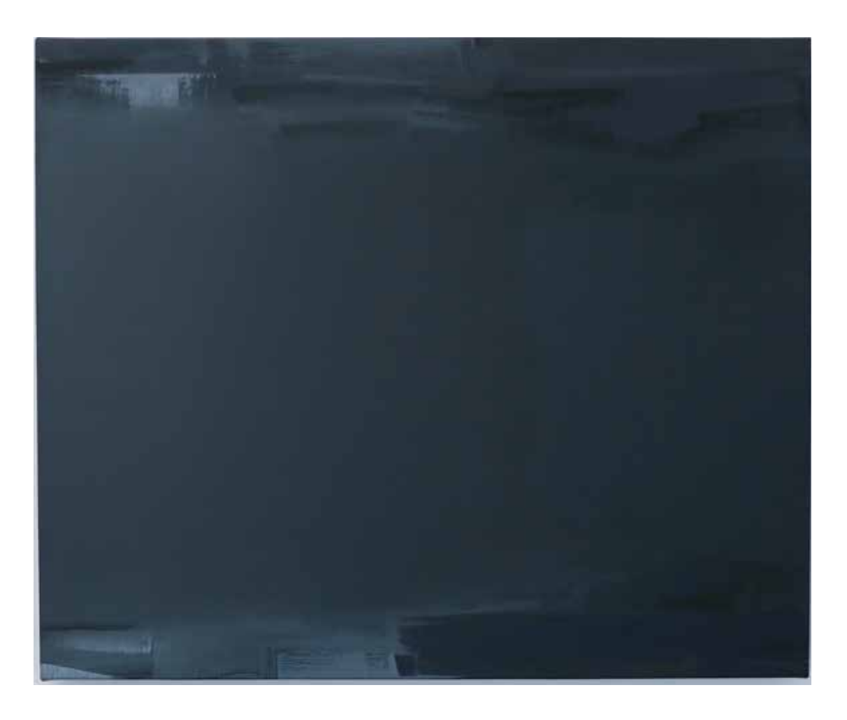
this painting, 2015, oil on linen, 21.5 x 26 inches